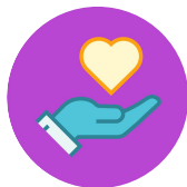
Inclusive Programming & Equitable Systems*